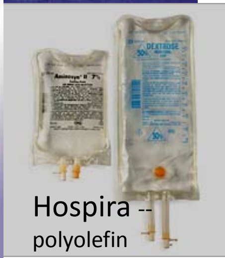
Hospira -- polyolefin