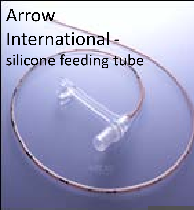
Arrow International - silicone feeding tube