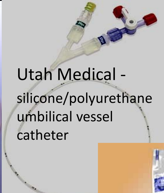
Utah Medical - silicone/polyurethane umbilical vessel catheter