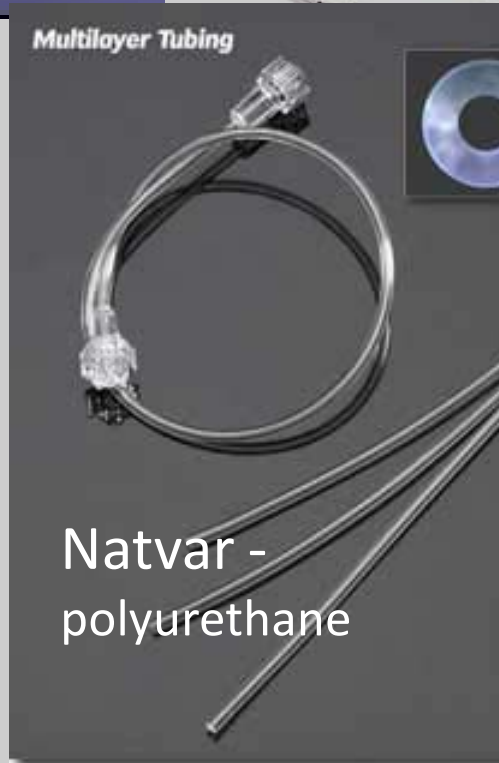
Multilayer Tubing Natvar - polyurethane