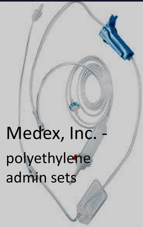
Medex, Inc. - polyethylene admin sets