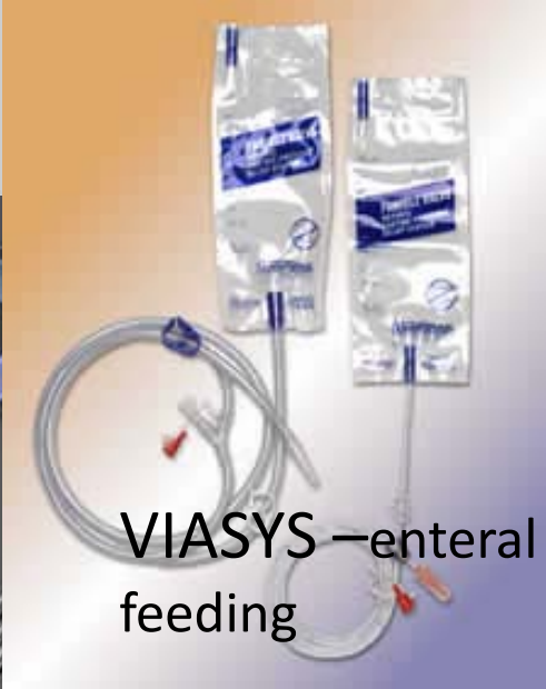
VIASYS - enteral feeding