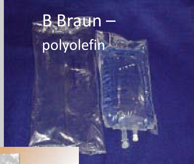
B Braun - polyolefin